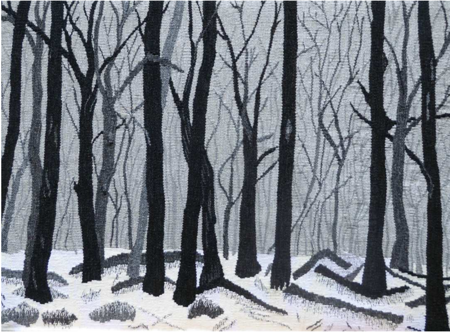
Burnt Trees in the Snow