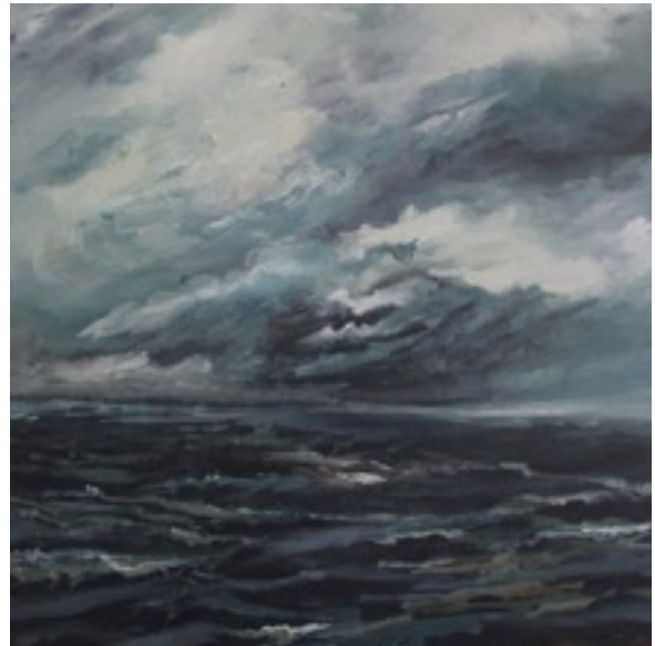
Evening storm 30 x 30cm. synthetic polymer on beechwood panel $520