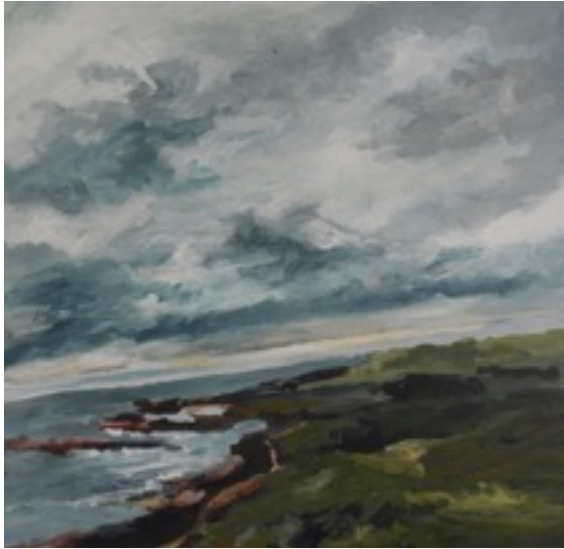
Morning on the kelp track 30 x 30cm synthetic polymer on beechwood panel $520