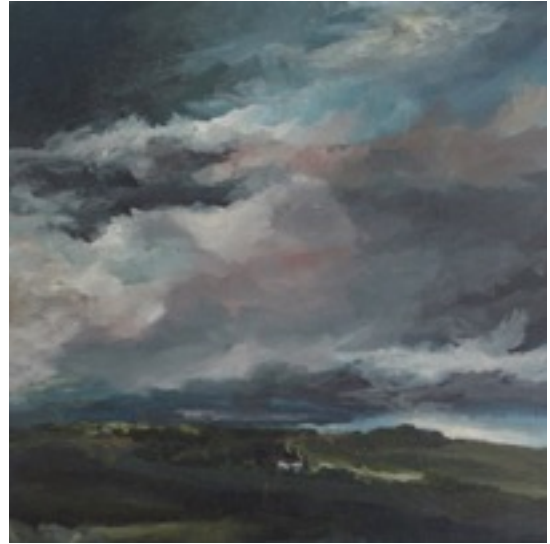
Last light at Clare's cottage 30 x 30cm synthetic polymer on beechwood panel $520