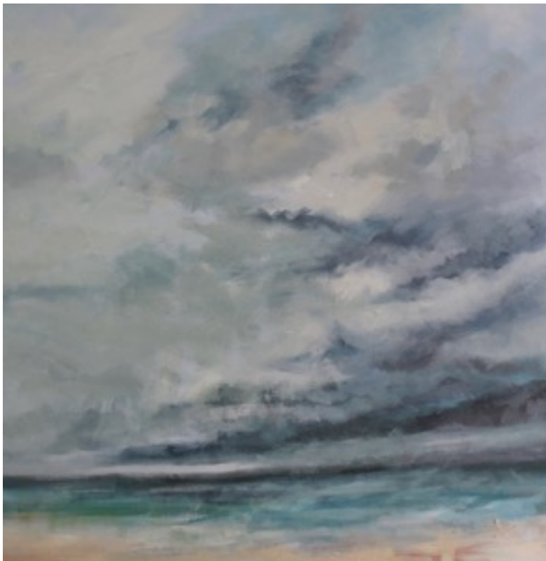
Storm at sea. Panel 2. 71 x 71 cm Synthetic polymer on canvas $1200