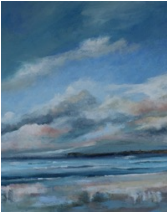
South Coast Beach Evening 25 x 20cm synthetic polymer on beechwood panel $280