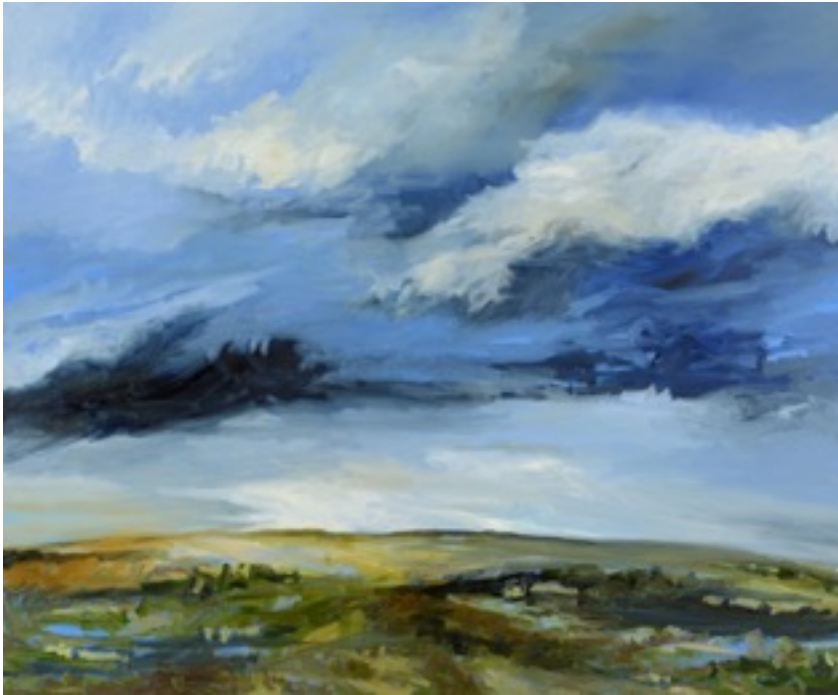
Swept Away-Cataraqui Coast 125 x 152 cm. oil on canvas $3200

Ivy Hill Gallery 22 February - 25 March 2018