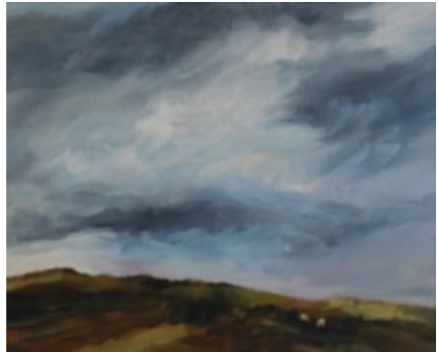
Louring sky 2 20 x 25cm synthetic polymer on beechwood panel $280