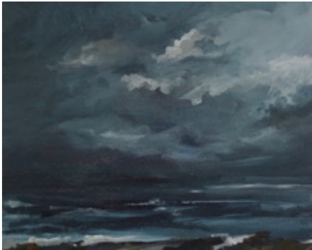
Winter Nocturne 1 20 x 25cm synthetic polymer on beechwood panel $280