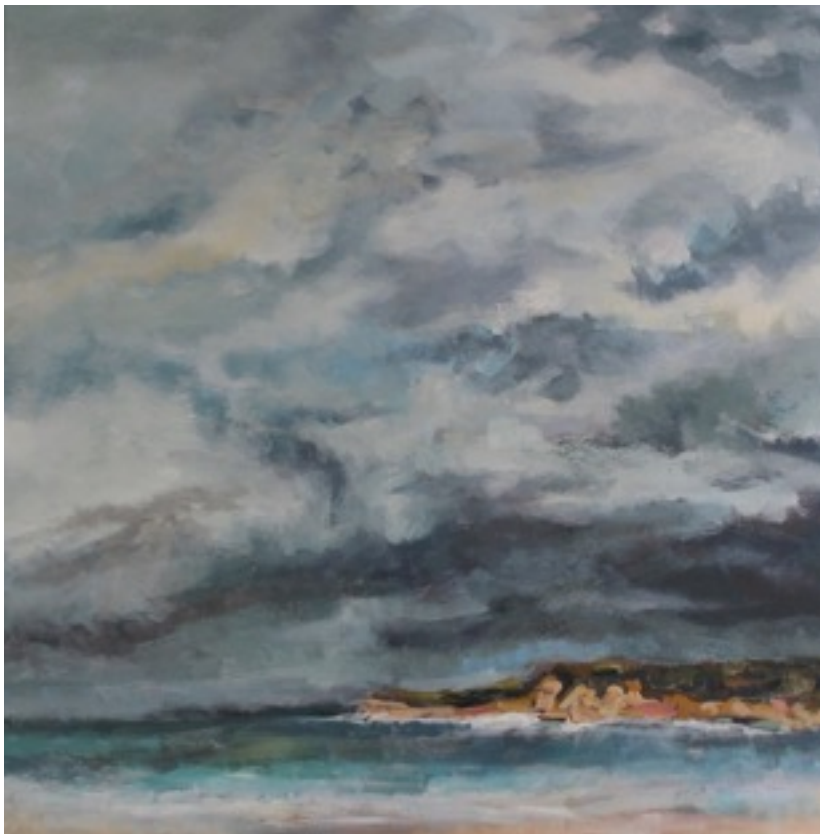
Storm at sea Panel 4. 71 x71cm Synthetic polymer on canvas $1200