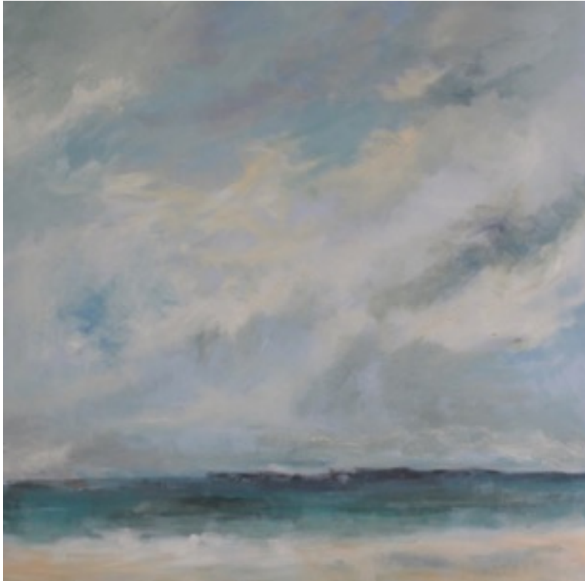
Storm at sea Panel 3. 71x71cm Synthetic polymer on canvas $1200