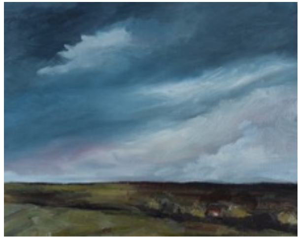
Summer evening on the Farm 20 x 25 cm synthetic polymer on beechwood panel $280