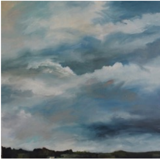
Autumn morning. King Island 30 x 30cm synthetic polymer on beechwood panel $520