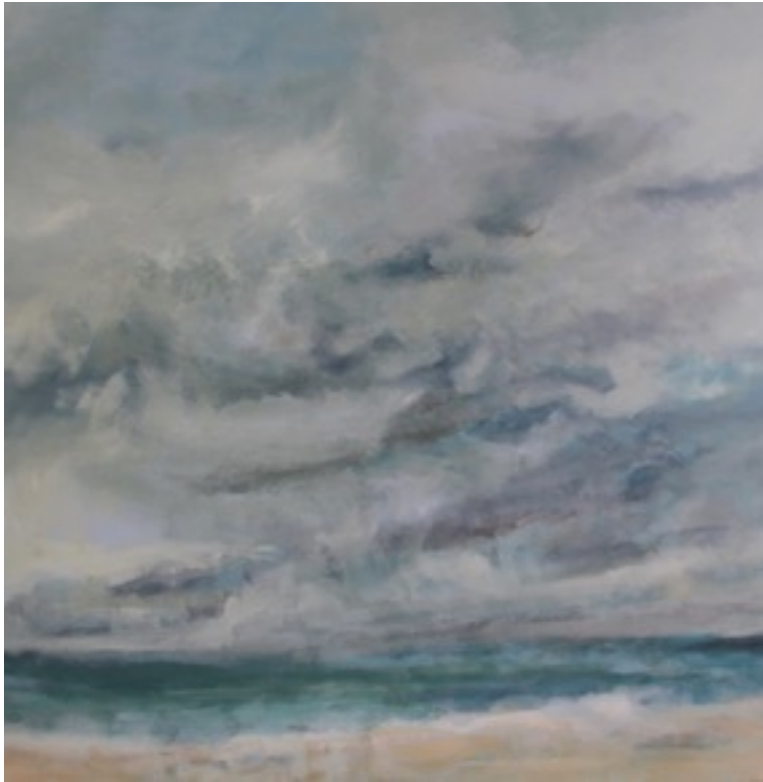
Storm at Sea Panel 1. 71 x 71 cm Synthetic polymer paint on canvas $1200