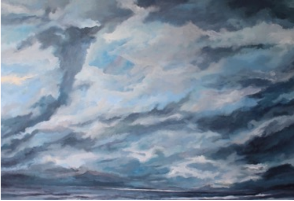
Louring sky 153 x 102 cm synthetic polymer and oil on canvas $2,200