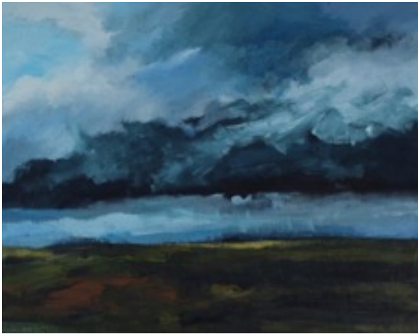
Approaching Storm 20 x25cm synthetic polymer on beechwood panel $280