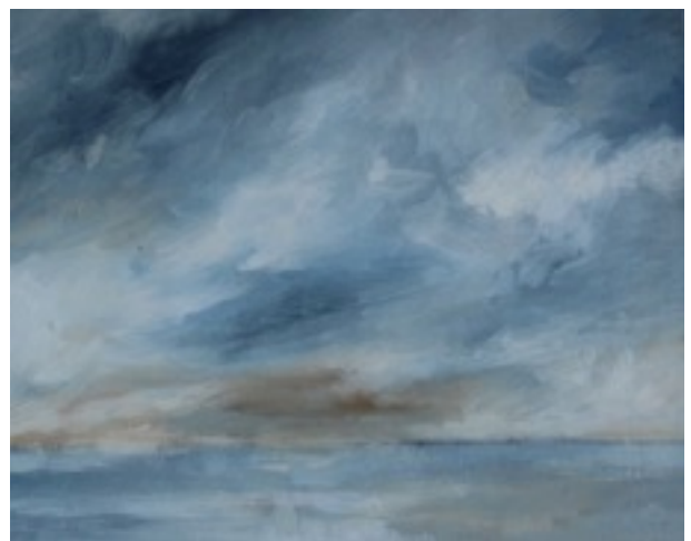
Remembering 20 x 25cm synthetic polymer on beechwood panel $280