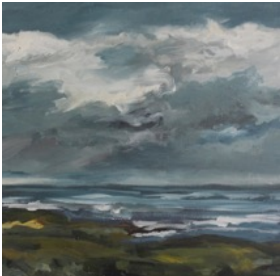
Wild weather ahead 30 x 30cm. synthetic polymer on beechwood panel $520