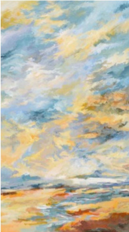
A Day on the Island 180 x 92cm. synthetic polymer on canvas $2,200